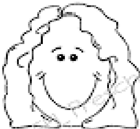
m o m m y