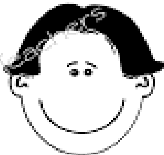
d a d d y