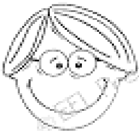
b r o t h e r