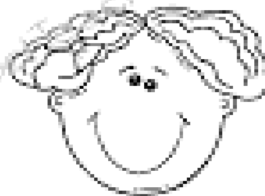
s i s t e r